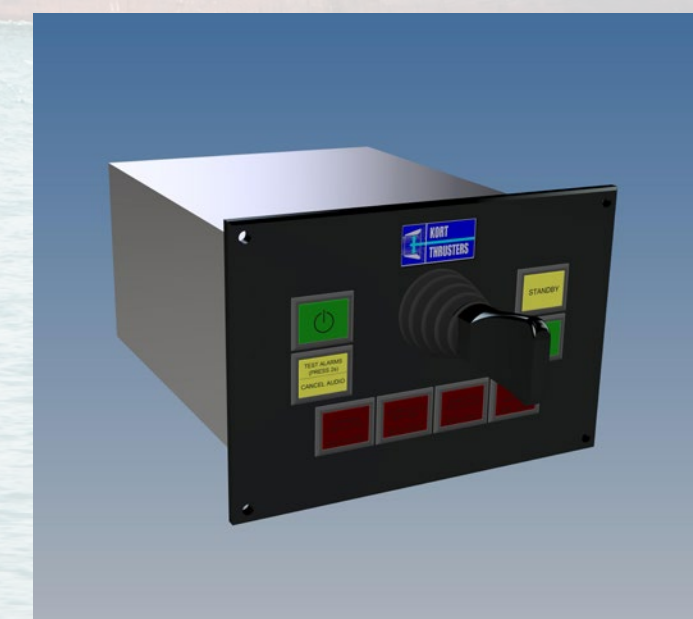
KT170 Tunnel Thruster